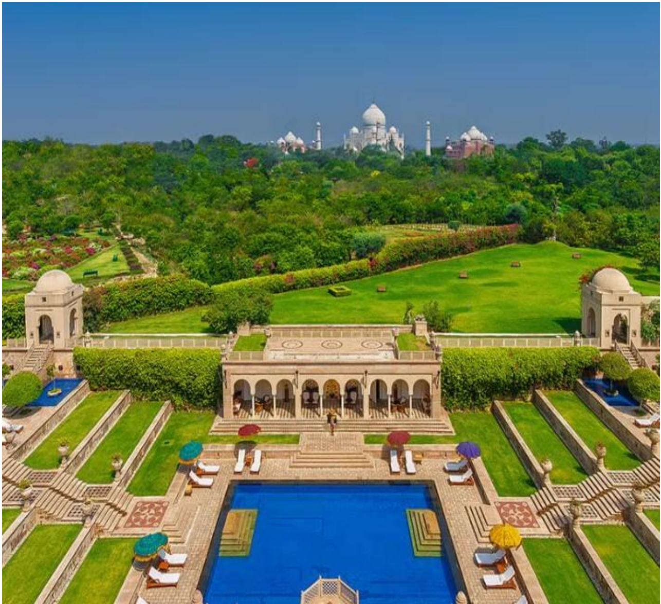
The Oberoi Amarvilas, Agra

At sunrise, witness the ethereal beauty of the Taj Mahal, an eternal masterpiece of love—a timeless tribute to love and artistry. Return to the hotel and savour a sumptuous breakfast, impeccably presented and reflective of refined hospitality, before departing for Delhi.