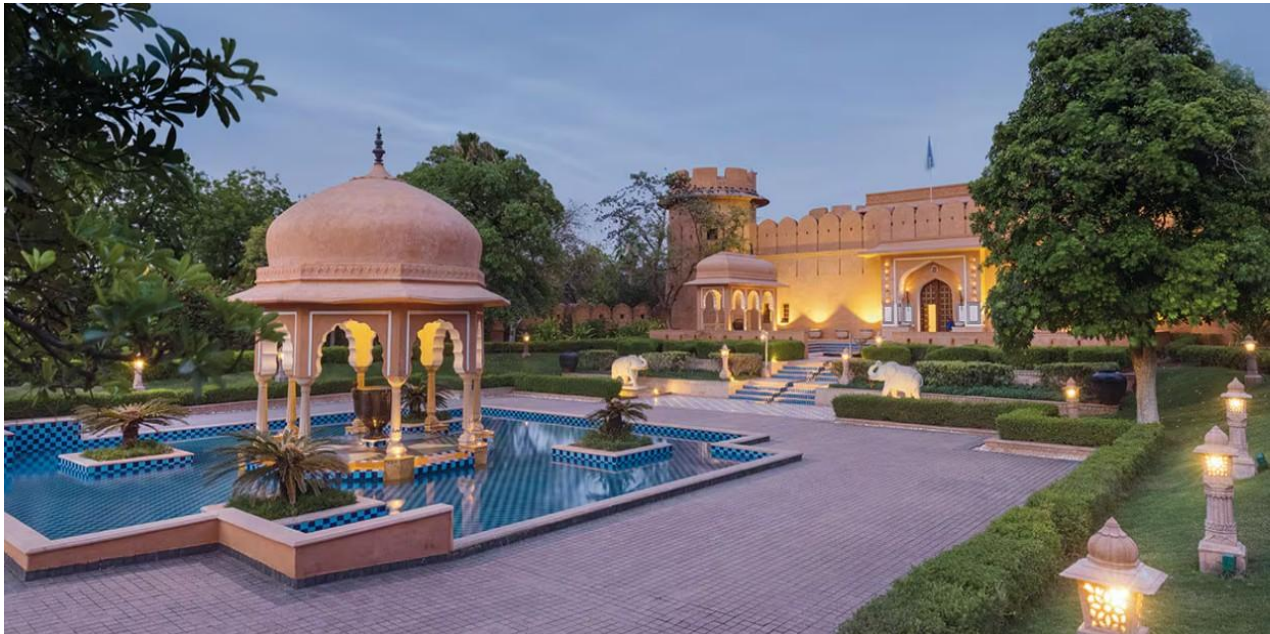
The Oberoi Rajvilas, Jaipur

Awaken to a curated breakfast at the hotel, then explore Jaipur's royal heritage with a visit to Amber Fort, including its Sheesh Mahal and courtyards. Pause at Hawa Mahal, Jal Mahal, and visit the 18th-century Jantar Mantar, passing through the elegant avenues of the Pink City. The afternoon is at leisure to unwind in comfort, followed by a refined dinner and a restful overnight stay.